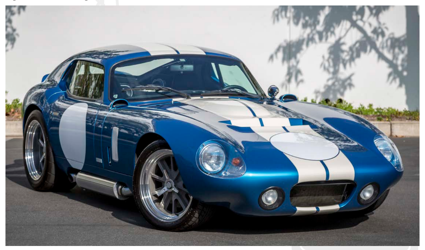
*Guardsman Blue with Wimbledon white twin stripes and white roundels shown.