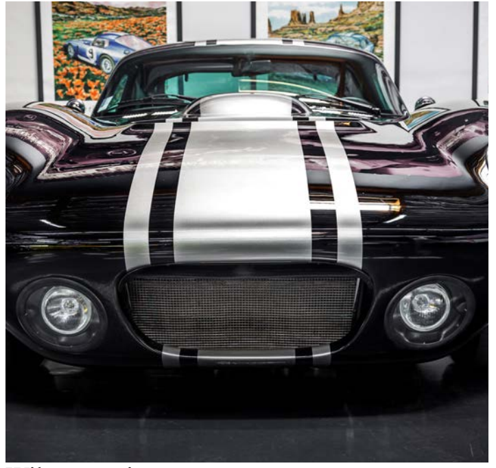
Half cove paint.